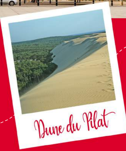
Dune du Pilat